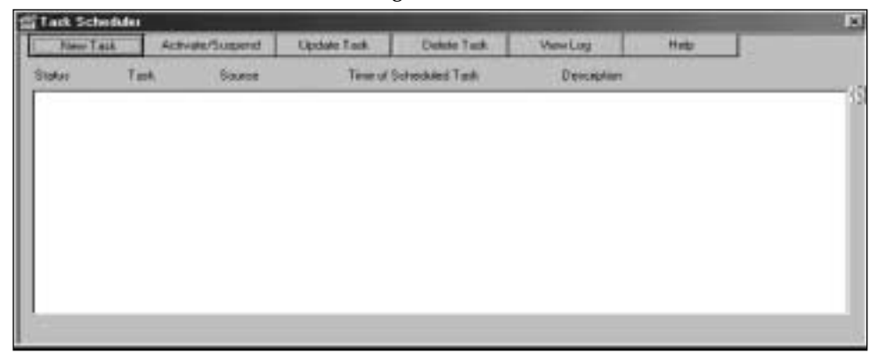
2. Click the New Task button.

1. From the Tools menu, select Task Scheduler . You will see the Task Scheduler dialog box.